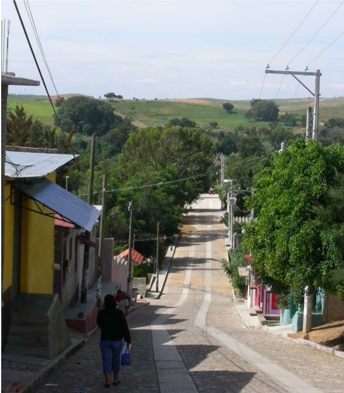
The town lies below the archeological ruins of Monte Alban.