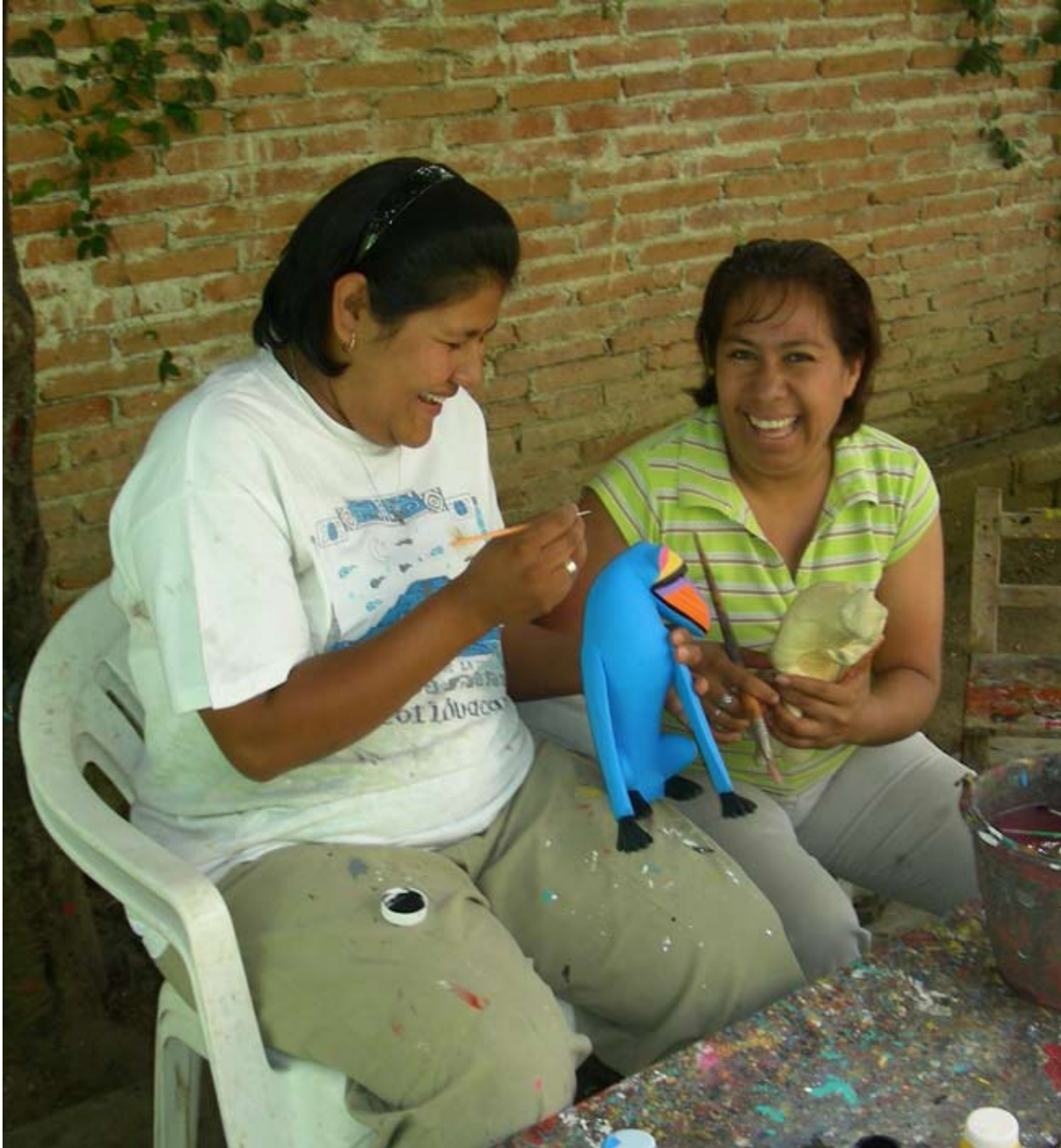
Then their wives Antonia and Oralia paint each figure.