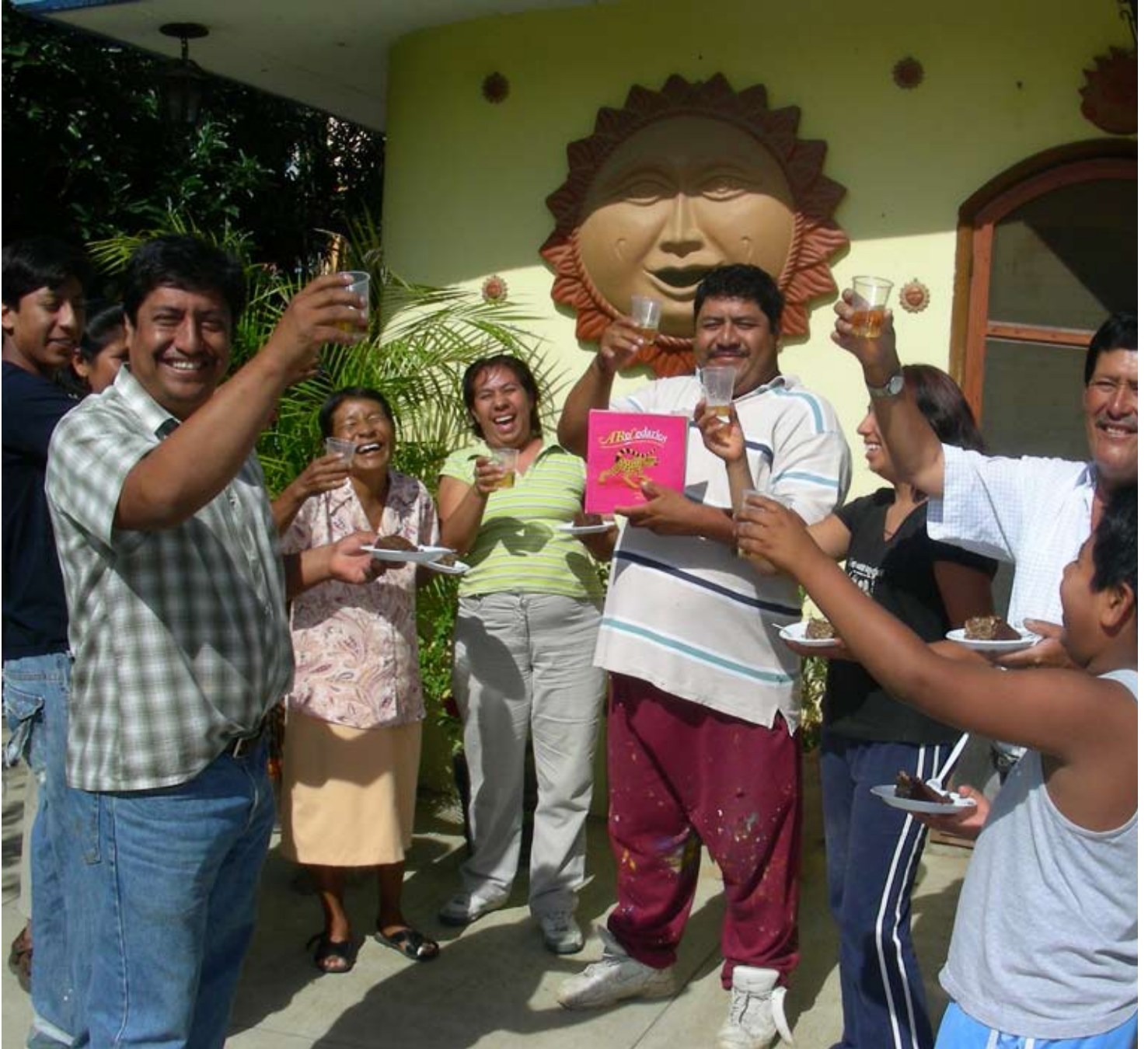
But they enjoyed the book party even more!