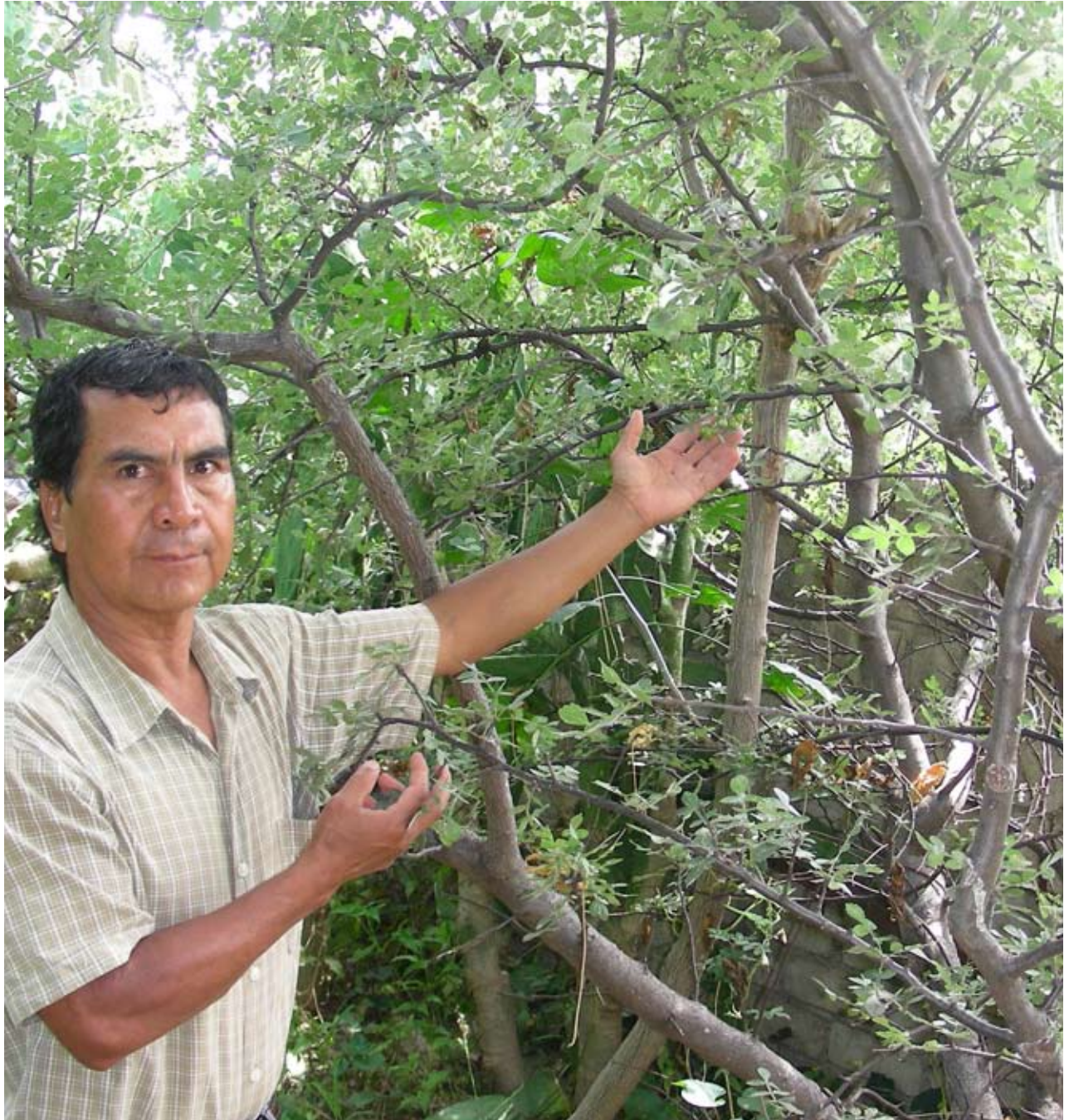
Carvers use the copal tree which grows plentifully in the mountains around their town.